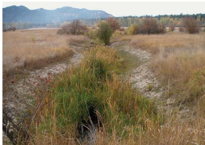
Two former cattle ranches that front the Pend Oreille River are being restored as habitat for wildlife.

These habitat types support populations of wildlife affected by the dam. The Kalispel Tribe's management activities have included planting trees along the river, stabilizing the river bank, enhancing stands of coniferous and hardwood trees, installing water control structures, burning vegetation in a managed way, managing pasture land, constructing nesting islands, and conducting general operations and maintenance activities that include monitoring and evaluation. These actions have helped target species, including Canada geese, mallard ducks, muskrat, white-tailed deer, bald eagles, and several species of song birds.