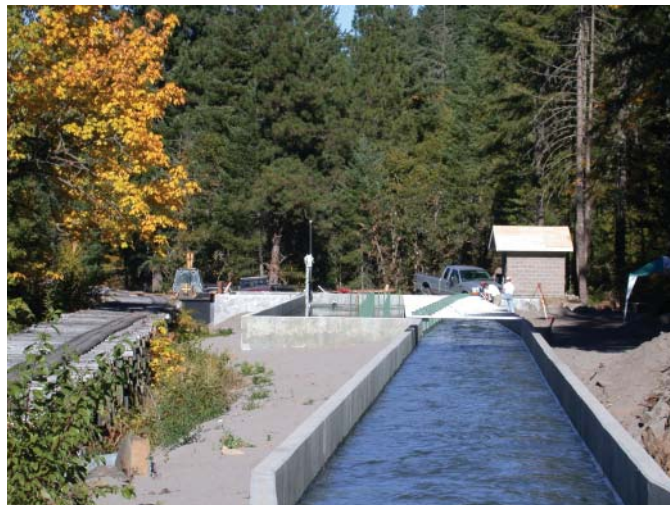
This fish diversion screen is on the mainstem Hood River. The screen was designed, developed, and patented by the Farmers Irrigation District. The Warm Springs Tribe performed biological testing to ensure the diversion allowed safe fish passage.

Since 1999, the program has completed a number of projects to address these problems, including construction of a diversion and screen at the Phoenix Pharms recreational fish facility and construction of fences to keep livestock away from streambank riparian areas. This includes planting native vegetation to help stabilize