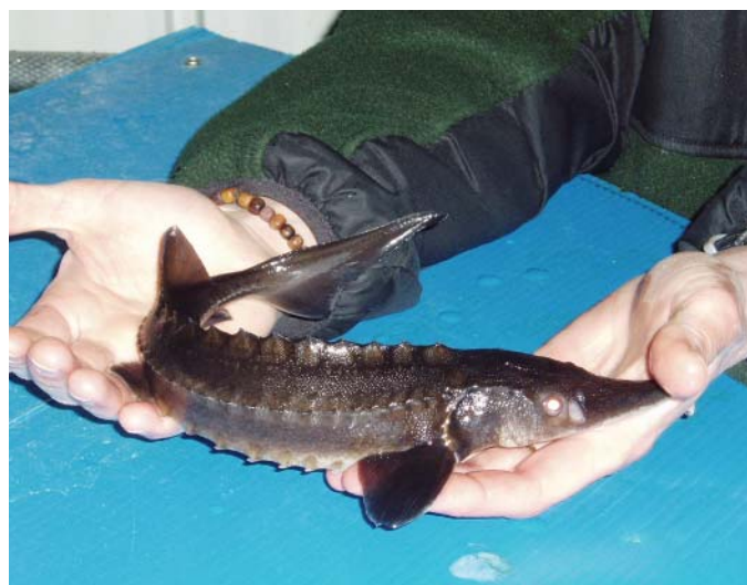
This juvenile sturgeon will be raised in captivity until it is able to survive on its own and then released into the Kootenai River.

Many changes to the natural ecosystem have occurred over the past decades, but one of the most significant changes was the construction and operation of Libby Dam, which altered the historic flow pattern in the lower Kootenai River, reducing the annual spring