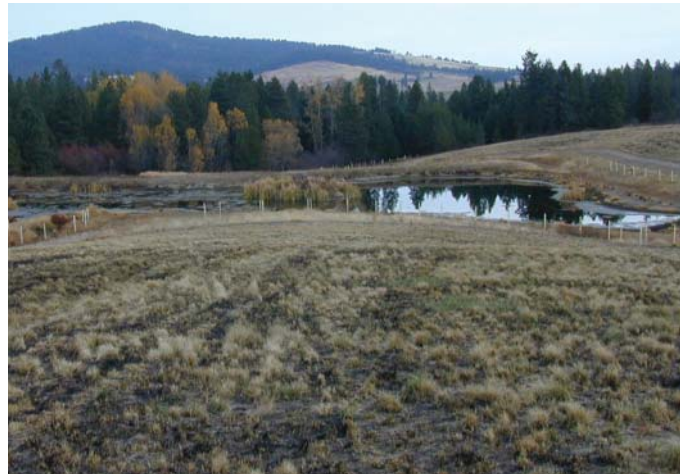
This pond on the Coeur d'Alene Reservation will collect runoff from agricultural fields and hold sediment that otherwise would wash into a fish-bearing stream at the base of the hill.

Another positive aspect of the project is that it is helping wildlife as well, Lillengreen said. One impact of converting timberland to farmland, notably along Lake Creek, has been a shift in the hydrology of the watershed. In short, the ground doesn't hold as much water as it once did. To help improve the water table, ponds have been built to catch and hold runoff from rain and melting snow. Some of this water finds its way back into the aquifer, and some is released to boost downstream flows. Meanwhile, the ponds provide water for birds and animals such as deer.