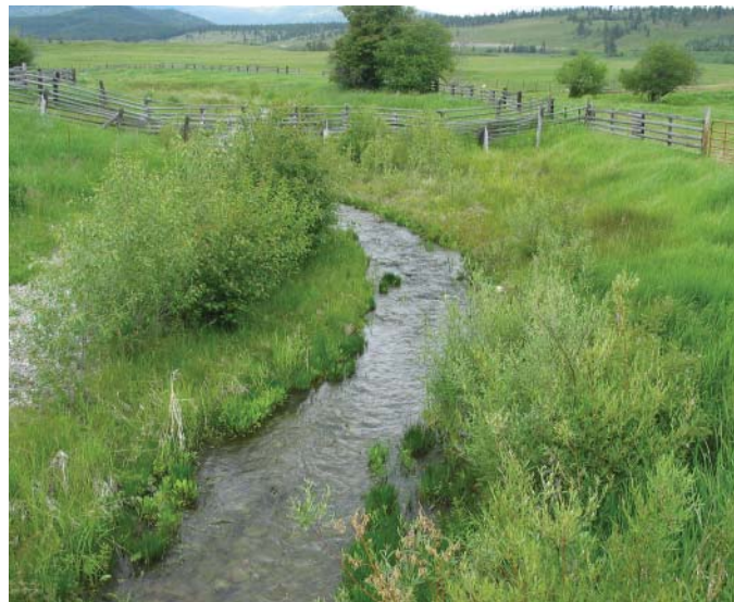
By 2004, riparian vegetation had been restored and the spawning habitat was much improved.

The Dayton Creek project is a good example of the kind of watershed-level projects implemented by the tribes. It was initiated because of its importance as a direct tributary to Flathead Lake. Dayton Creek was severely degraded and provided outstanding potential to replace the spawning habitat lost after the construction of Hungry Horse Dam. Bonneville funds have been used to provide cost-sharing for many restoration activities including: