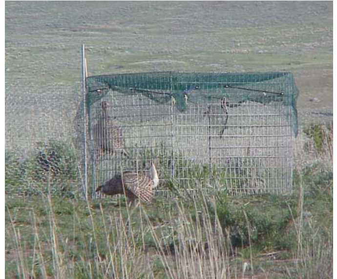
The Colville Tribes are working to rebuild the population of sharp-tailed grouse on the reservation by protecting and enhancing nesting habitat.

Today, Columbian sharp-tailed grouse are classified by the U.S. Fish and Wildlife Service as a threatened species in Washington.