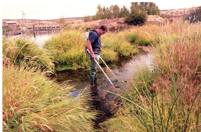
A researcher with the Umatilla Tribe uses an electric device to stun lamprey in the Umatilla River.

The Pacific Lamprey Research and Restoration project, initiated in 1994, is sponsored by the Confederated Tribes of the Umatilla Indian Reservation. The goal of the project is to restore the natural production of Pacific lampreys in the Umatilla River to self-sustaining and harvestable levels. While the current population numbers are low, the Umatilla River Basin historically produced significant numbers of lampreys. These provided fishing opportunities for tribal members. Recovery efforts for salmon and steelhead in the basin may help with the overall recovery of Pacific lampreys, as they share habitat and require similar environmental conditions to thrive. Like salmon and steelhead, lampreys bring important marine nutrients to watersheds when they return to spawn and die in streams and rivers.