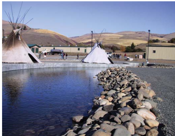
Teepees at the hatchery on its dedication day in 2002 remind visitors of the importance of salmon to the tribal culture.

Beginning early in the 20th century, dams decimated salmon and steelhead runs in the Clearwater River and its tributaries. Over