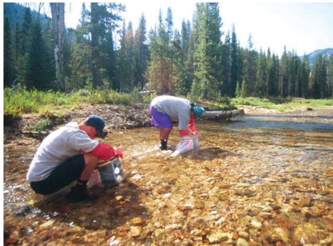
These men are collecting samples of invertebrate organisms in Bear Valley Creek, a tributary of the Middle Fork Salmon River.

Counts of Chinook salmon redds in the drainage exceeded 1,000 per year in the middle 1950s but decreased to fewer than 10 from 1994 - 1996 (the low was three in 1995). While many factors contributed to this decline, one of the primary culprits was dredge