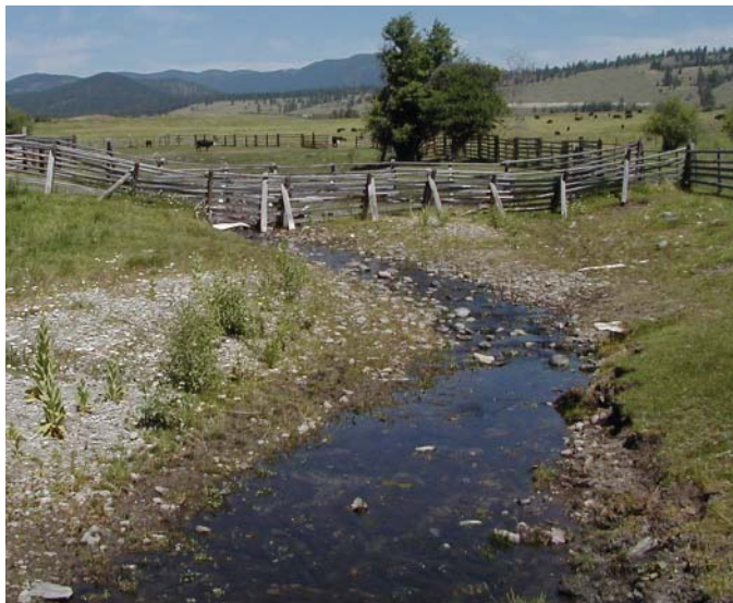
Before: In 2001, fish-spawning habitat in Dayton Creek, which flows into Flathead Lake, was in bad shape.

The Hungry Horse Mitigation Program, implemented in part by the Confederated Salish and Kootenai Tribes, began in 1991 to address fisheries losses associated with the construction and operation of Hungry Horse Dam. The dam isolated approximately 38 percent of the Flathead Lake drainage and changed the physical and biological characteristics of the lake and river. The Northwest Power and Conservation Council recommends funding from the Bonneville Power Administration to address this loss of habitat in the interconnected Flathead Lake and Flathead River Basin. The project implements mitigation measures, restores habitat, and monitors the biological responses to those measures, including those implemented by other agencies. The tribes also address the changes in Flathead Lake from Mysis shrimp and lake trout, whose dominance has suppressed the native cutthroat trout targeted by mitigation efforts.