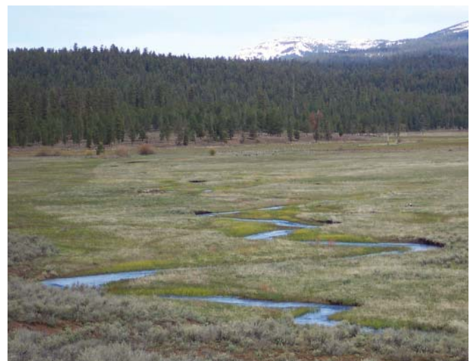
The project area includes one of the largest wetland complexes in the state.

A variety of wildlife will benefit. The wet meadow habitats of the Logan Valley represent one of the largest wetland complexes in the state of Oregon and are home to one of the few populations of upland sandpipers in the western United States. The project also will significantly enhance habitat for bull trout (a threatened species un-