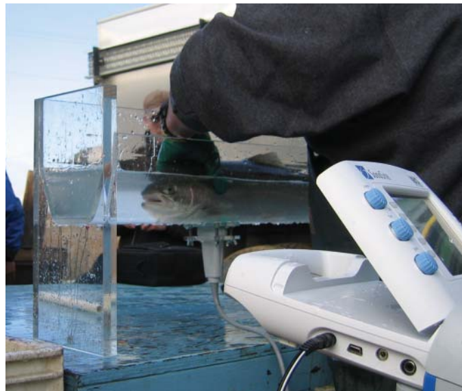
CRITFC researchers use ultrasound to check for gonad development in a wild steelhead at Prosser, Washington, on the Yakima River as part of a study of the effectiveness of reconditioning steelhead kelts — fish that return from the ocean more than once to spawn.

Initial research established that kelt reconditioning not only worked, it substantially bolstered the number of repeat spawners in