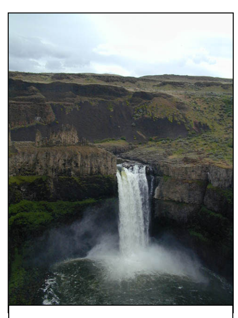
Figure 3. Palouse River Falls

Over 398 miles of stream are included within the Palouse River drainage. The major tributaries and their representative percentage of the overall subbasin include: