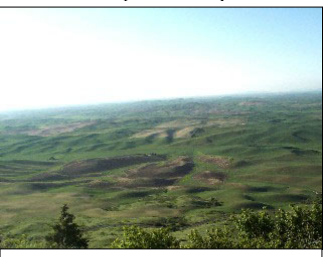
Figure 1. Rolling Palouse hills.

The southbound movement and melting of glaciers and ice fields in southern British Columbia created ice dams in the valleys, forming massive lakes. When ice dams burst, the released water swept away the loess material and soil was scoured down to the lava field floor. This "floor" of basalt, a dense crystalline lava, covers more than 100,000 square miles in parts of Washington, Idaho and Oregon.