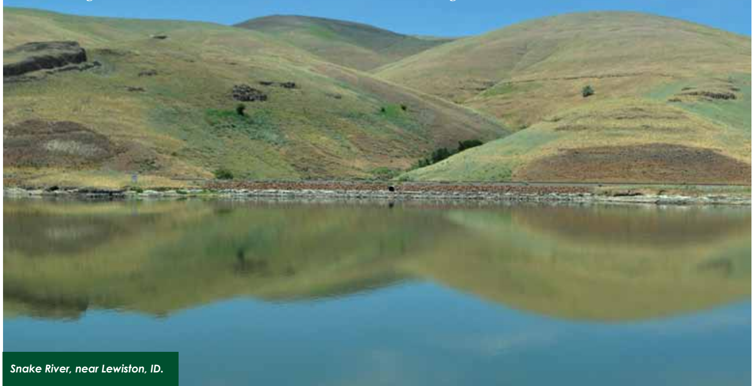
Snake River, near Lewiston, ID.

And the fact that solar resources typically provide generation at times when the utility’s load is peaking makes it a good fit.