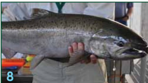
Council recommends funding for projects to improve scientific knowledge