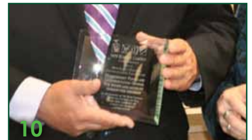
NW Energy Coalition honors Council with conservation award