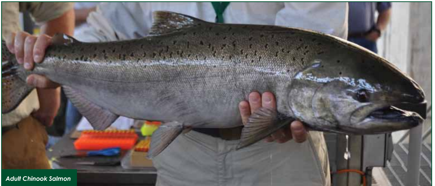
Adult Chinook Salmon

The recommended projects address survival of salmon in the near-shore ocean and the Columbia River estuary, plus research on sturgeon and Pacific lamprey in the lower Columbia River, fish-tagging for research and harvest-enumeration purposes, and monitoring the effectiveness of projects designed to improve fish habitat. The Council approved 100 of the projects in