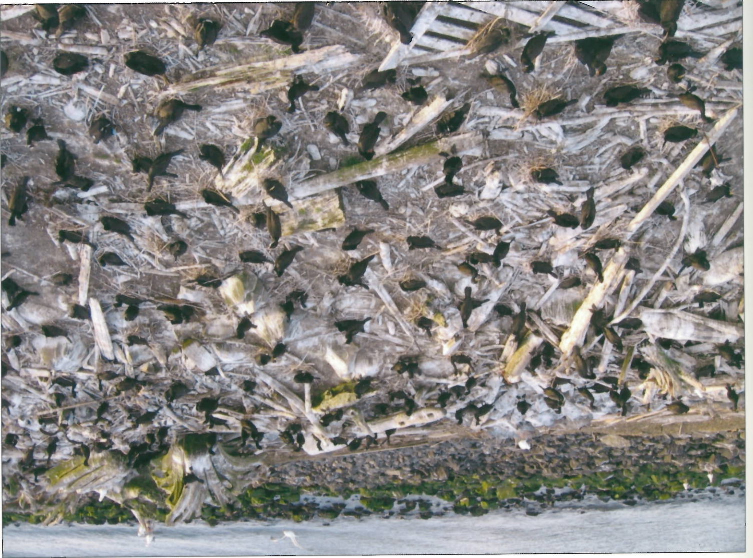
Double-crested cormorants nesting amid driftwood on East Sand Island.

Further reductions in the size of the tern nesting area are planned in the coming years and will likely result in a significant decline in the number of terns attempting to nest on East Sand. Given the growing number of smolts consumed by double-crested cormorants nesting on the island, resource managers are considering similar plans to relocate nesting cormorants from East Sand to other sites along the Pacific Coast. The project is partially funded by the Bonneville Power Administration through the Council's Columbia River Basin Fish and Wildlife Program, and the U.S. Army Corps of Engineers. Project partners also include Oregon State University, Real Time Research, and the U.S. Geological Survey.