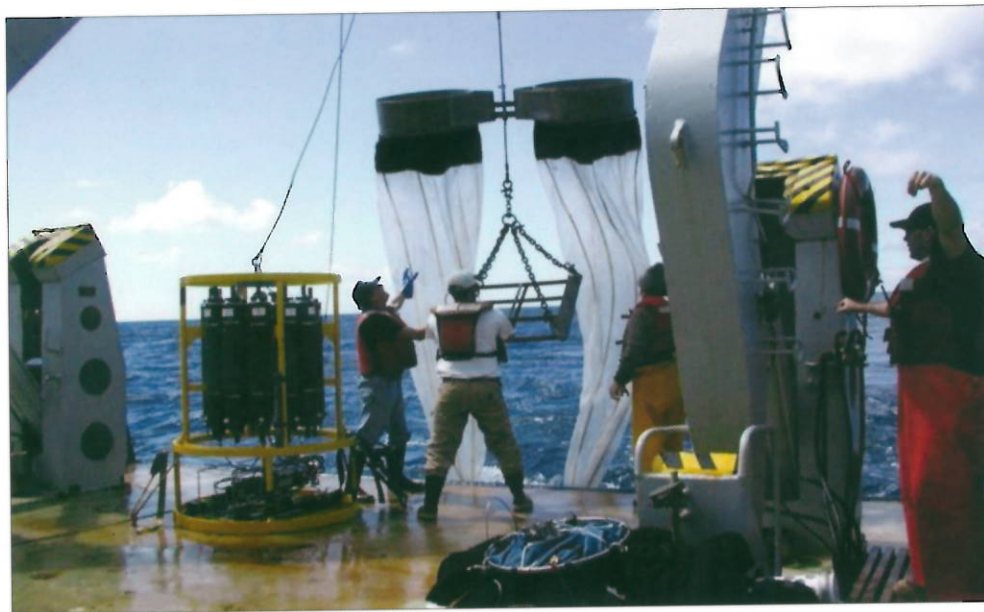
Scientists prepare to trawl for juvenile salmon off the Oregon coast.

U SING 16 INDICATORS of weather and ocean conditions in the Pacific Ocean, scientists at the National Oceanic and Atmospheric Administration are improving their ability to understand why Columbia River salmon runs are abundant in some years and scarce in others.