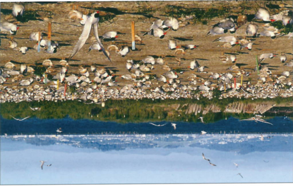
Caspian terns on East Sand Island prefer to nest on open sand.

Further reductions in the size of the tern nesting area are planned in the coming years and will likely result in a significant decline in the number of terns attempting to nest on East Sand. Given the growing number of smolts consumed by double-crested cormorants nesting on the island, resource managers are considering similar plans to relocate nesting cormorants from East Sand to other sites along the Pacific Coast. The project is partially funded by the Bonneville Power Administration through the Council's Columbia River Basin Fish and Wildlife Program, and the U.S. Army Corps of Engineers. Project partners also include Oregon State University, Real Time Research, and the U.S. Geological Survey.