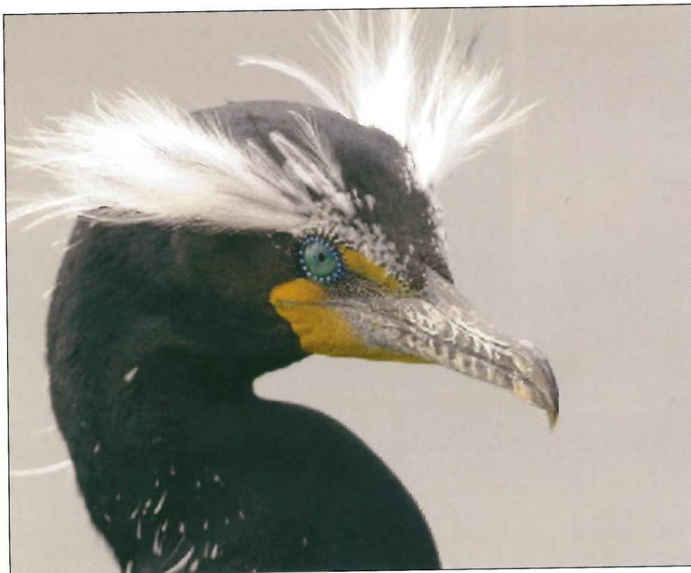
Feathery crests give this seabird its name.