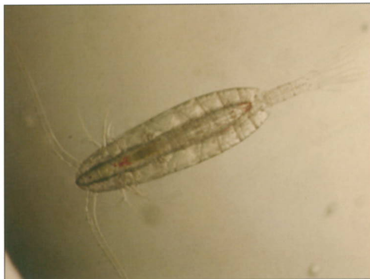
This "fat" krill from Alaska (left) has more nutrients for juvenile salmon than its skinnier cousin from California (right).