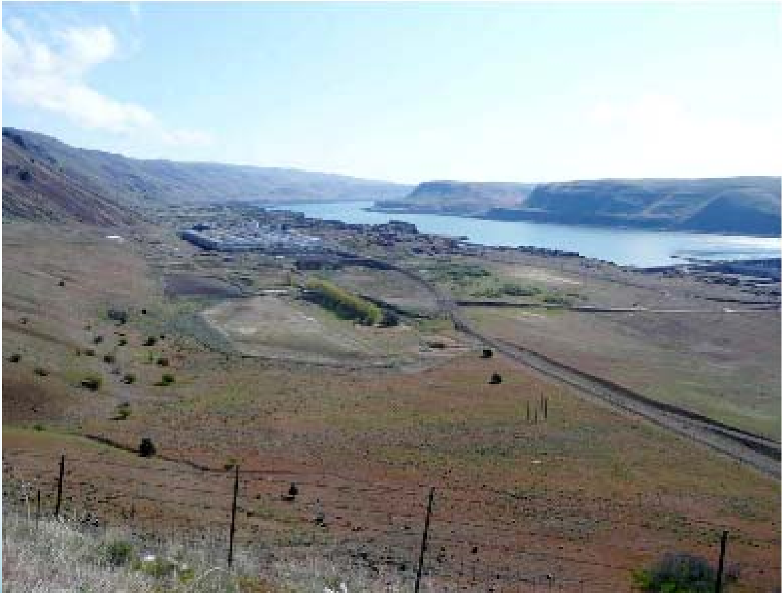
* View of plant, and site for lower reservoir looking east