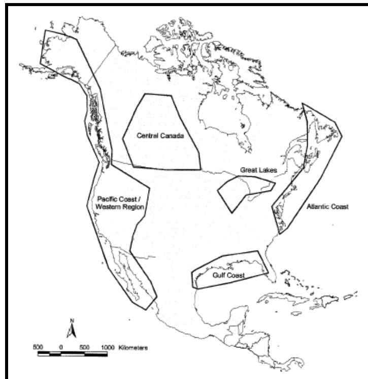
Figure 12-2. Outlines of five more-or-less distinct breeding regions of the Caspian tern in North America, after Wires and Cuthbert (2000). Regional boundaries may need refinement after further study.