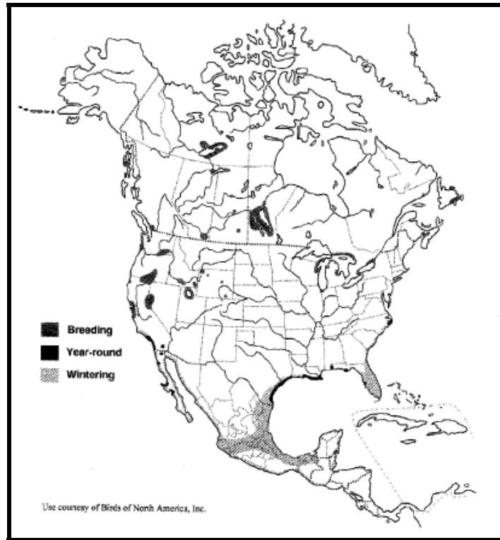
Figure 12-1. Seasonal distribution of the Caspian tern in North, Central, and South America. The species winters locally within the dashed line. Adapted with permission from Figure 1 in Cuthbert and Wires (1999).