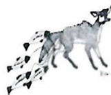
Canadian Columbia River Intertribal Fish Commission